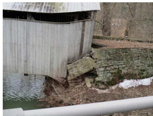
Go Fund Me Page