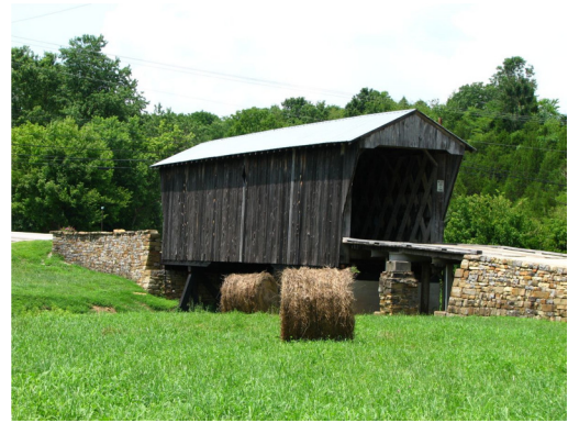
Goddard Bridge, Fleming County, KY

Raising awareness of the bridges will not only encourage tourism in those areas, but raise awareness of the need to maintain them. Kentucky has spent millions of dollars restoring the bridges one-by-one. The Beech Fork Bridge in Washington County is presently being restored. The recent restorations at Cabin Creek and Johnson Creek will be visited during the Society's fall tour in October.