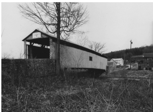
April 9, 1965

(From: E-mail correspondence between DCBPP and NSPCB)