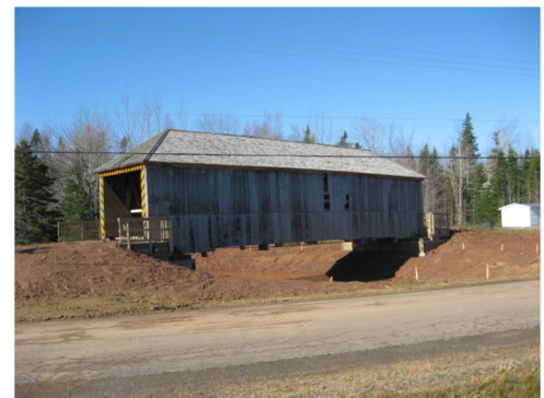
Peter Jonah Bridge at its new location