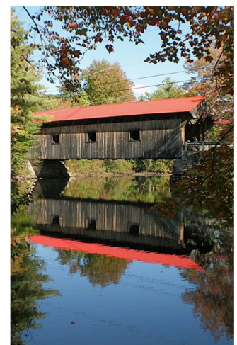
Waterloo Station Bridge Warner, NH