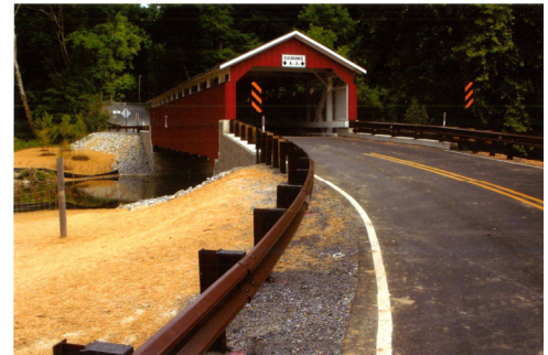
New Schlicher's Bridge, July 2014

Page 164, update directions of Peter Jonah Bridge, 55-01-07, in Albert County, New Brunswick. It has been moved to a new location over dry ground 2.9 miles (4.6km) north of Turtle Creek on NB 910, then just left (ahead) on Dewey Rd. N46° 00.175' W064° 54.01'