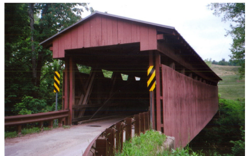
Sarvis Ford Bridge, 48-18-01#2 May 21, 2014