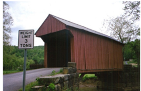
Walkersville Bridge, 48-21-03 May 20, 2014