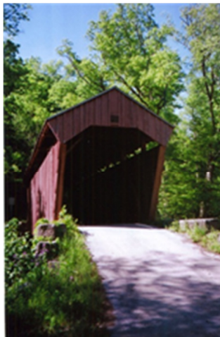
Fletcher Bridge, 48-17-03 May 19, 2014