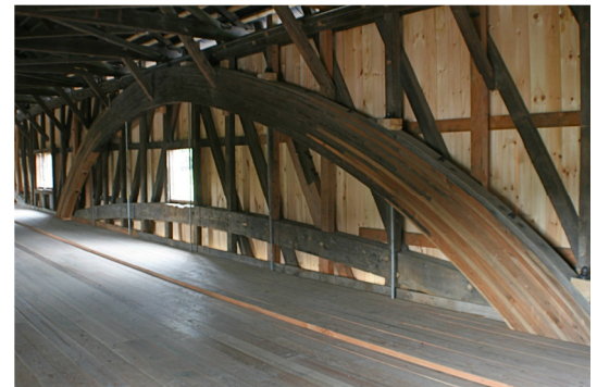
Interior of Bath Bridge, Bath, NH

Originally planned to re-open in June, the project was extended after additional damage to structural timbers was discovered. Engineering work was done by Hoyle, Tanner and Associates with construction by Wright Construction Co.