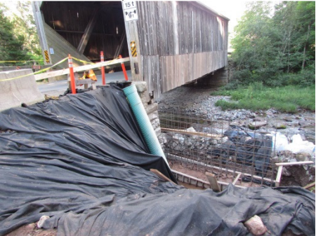
New wing wall being constructed. Photo by Clarence Ball, August 2015