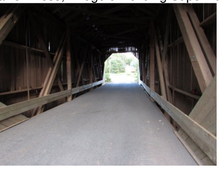
Epoxy coating added to protect the wooden deck.