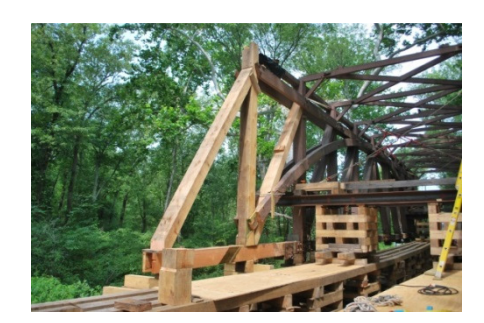
Repairs to the southwest end. August 6, 2015