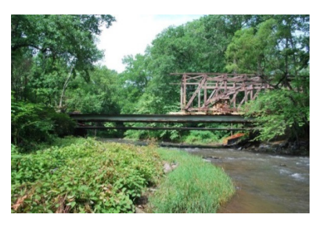
Bridge being moved off of the river. June 15, 2015