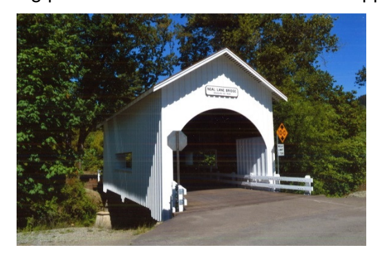
Neal Lane Bridge, June 12, 2015