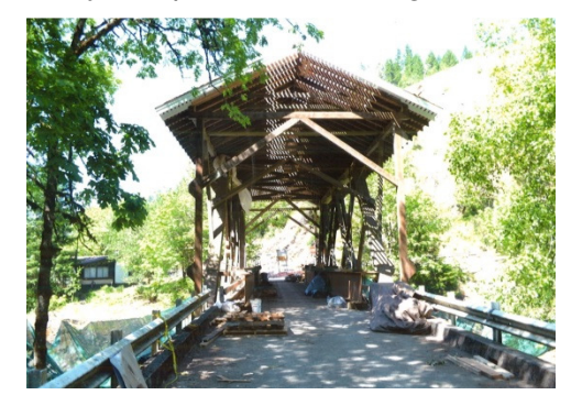
Cavitt Creek Bridge under repair, June 13, 2015

In mid-June the Cavitt Creek Bridge was undergoing truss repairs and receiving a new roof. Steel beams are being used to support the bridge while the work is underway. Work on the Neal Lane Bridge was recently completed. The bridge has a new roof and siding plus new tension rods for added support.