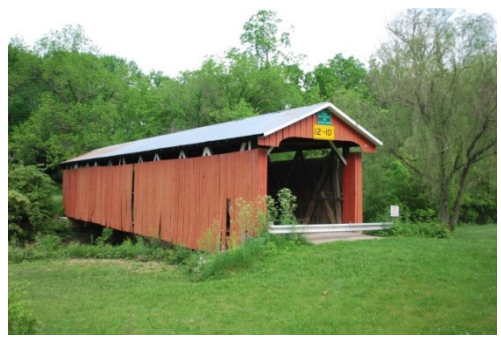
Jim Smedley Photo Before Repairs