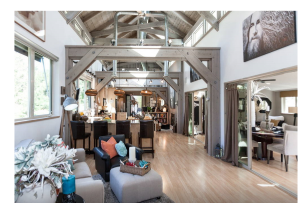
(From: Lauren Pilo article, May 2015, goodhousekeeping .com)