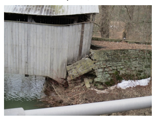
Go Fund Me Page