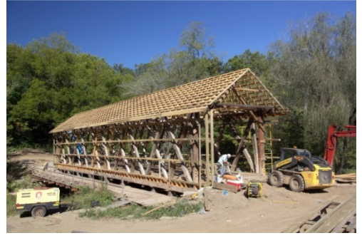
Steve Wolfhope Photo During Repairs