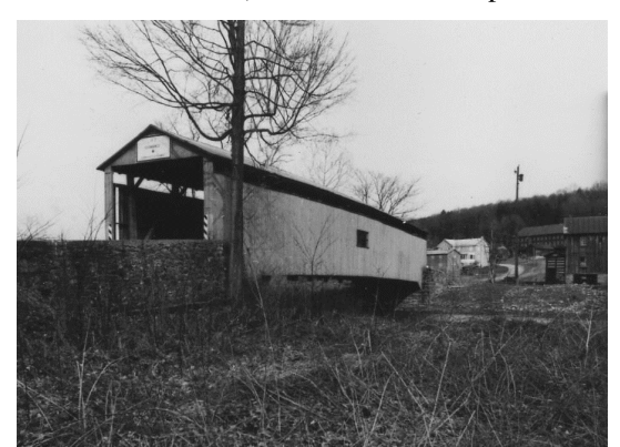
A. Schwab Photo, April 9, 1965

(From: E-mail correspondence DCBPP and NSPCB, February 2016)