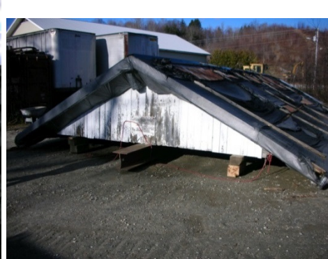
C. E. Walker Photo from NSPCB Archives