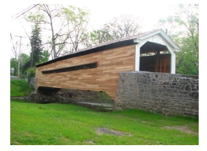
Rapp's Dam Bridge