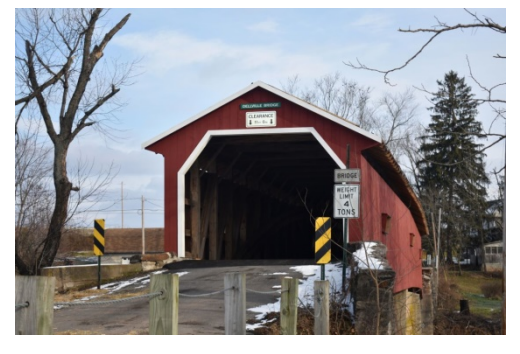
Bell's Mill Bridge, Westmoreland County - #38-65-01

Part of Bells Mills Road was closed in late January after a portion of the County's last covered bridge was