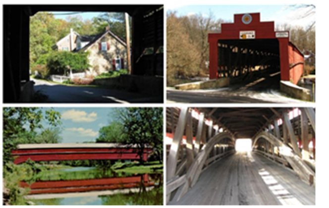
WG#38-06-07 Dreibelbis Station Bridge Berks County, PA 2019 Rehabilitation Project See the Covered Bridge News section for project details.

In the past, some agencies and outside groups have had a tendency to see only the dollars involved and "required" completion dates for a covered bridge project rather than the historic maintenance, restoration or rehabilitation of the structure itself. When federal, state and/or local agencies or groups charged with protecting and preserving these bridges allow situations like this to occur, they have failed in their responsibilities and have rendered the truly historic preservation of these structures to become a secondary consideration at best.