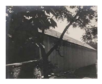
Frankenfield Bridge #PA/38-09-09 Expected completion late spring/early summer