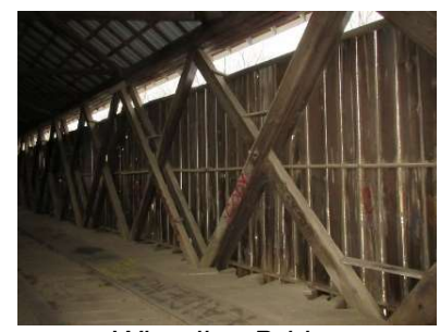
Old Red Bridge