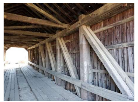
Interior of the bridge