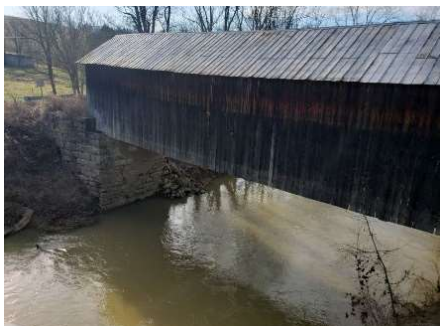
The bridge has a noticeable sag