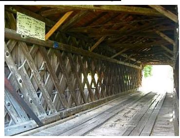
Smolen Gulf Bridge