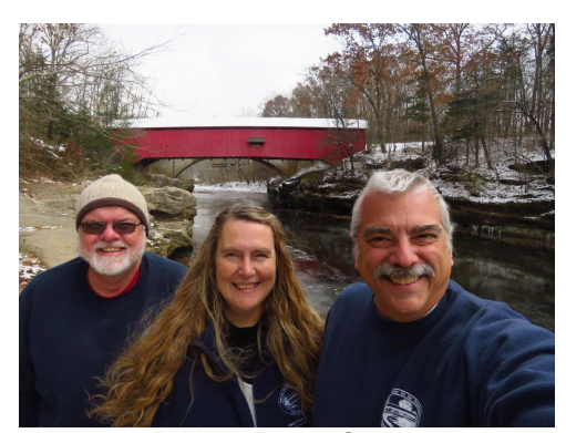
Narrows Bridge, Parke County, Indiana

Those of you who are members of the Covered Bridge Society of Oregon will have received the same sad news as I did. After 40 years of watching over the state's covered bridges, 2020 will be the organization's final year. When the Society was formed, Oregon's covered bridges were much more threatened than they are today. We owe them a huge debt of gratitude for the work that they have done over the past four decades. Because of their efforts, many covered bridges were saved from replacement and received much needed repairs. In some cases, bridges which might otherwise have been removed were relocated and are still accessible. Thank you to all the past and present officers and active members who devoted so much of their time towards this worthy cause.