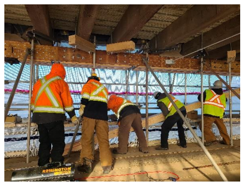
Crew lifting a new floor beam.

With the cold weather in the winter, and the humid summers, parts of the bridge began to deteriorate. Over time, the bridge has had patch repairs, but even then, the bridge has started to sag.