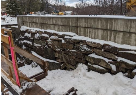
New southern abutment.