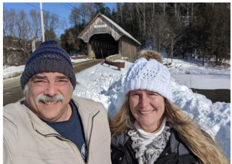
Coventry Bridge, Orleans County, Vermont February 8, 2021

With this issue, we welcome members of the Covered Bridge Society of Oregon. The Society disbanded last December after 40