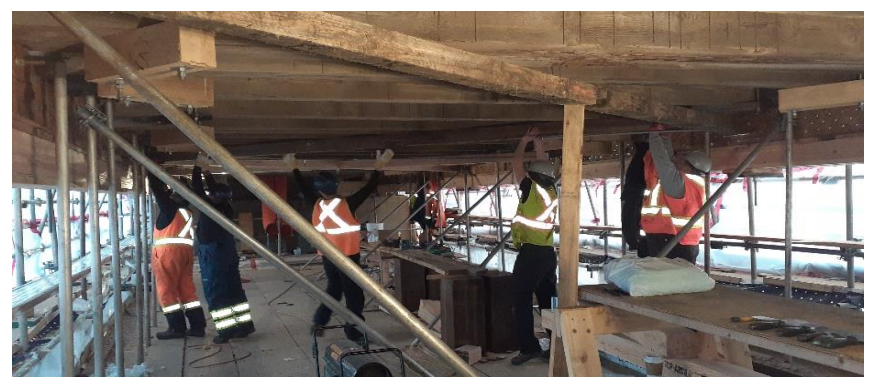
Setting a new floor beam in place.

restoration of the tension tie, or a "hard fix", which means the reinforcement will be fully engaged with dead and live loads. With this design, utilizing the lifting beams, replacing the hanger rods, and providing clamping force, a camber can actually be reinstated in the bridge. Over the years, as the bridge sagged, some of the truss connections were loose. With the reinstatement of camber, the gaps close - reengaging the connections.