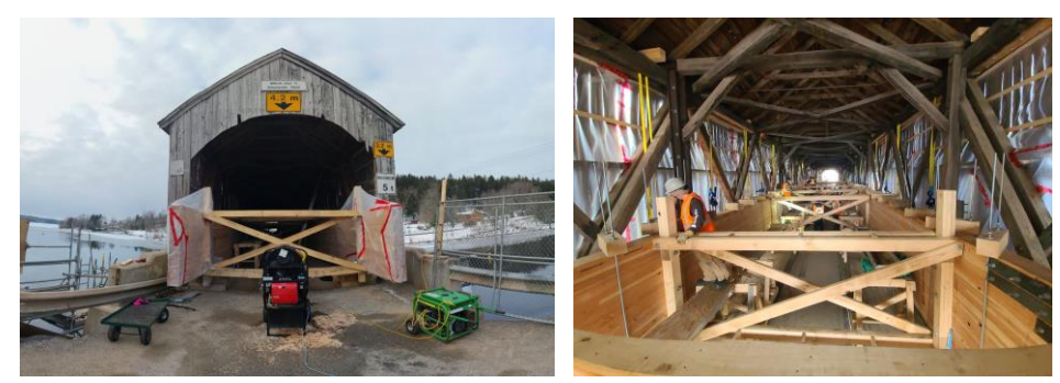
Large timber beams were inserted to support the bridge during repairs. They were also used to reinstate camber back into the structure.

Can you imagine wood lifting wood? The lifting beams reinforced were alulam. Since timber is lighter in weight, the 35m [115 foot] long lifting girders were rolled right onto the bridge, while maintaining the 5 tonne load rating. Concrete and steel would have been way too heavy. These beams were strong enough to lift the total dead weight of the bridge,