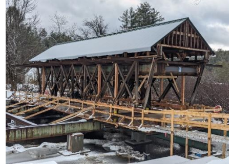
Temporarily relocated bridge.

Previous issues have described the work occurring at this bridge. Since our last update, the southern abutment has been rebuilt at its new height. The abutment is made of concrete that has been faced with the stones from the former abutment. It appears that the concrete work on the northern abutment is complete. That one will be faced with new granite blocks. The lower chords and a small number of truss timbers have been replaced while some others have had deteriorated sections cut out and new wood spliced in. Work stopped for the winter and will pick up again about the time you receive this issue.