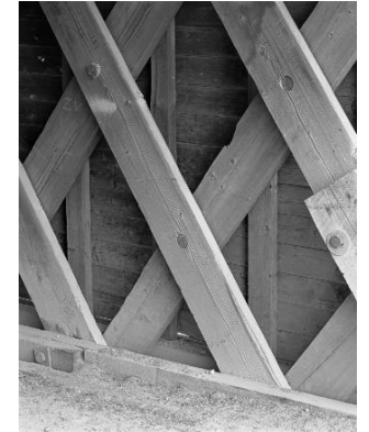
Joseph Conwill Photo of Single Pin Connection