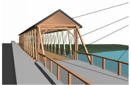
Diagram of reconstructed Bell Ford Covered Bridge

The Summer and Fall 2019 editions of this Newsletter reported