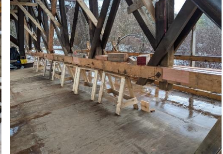
New lower chord in place.