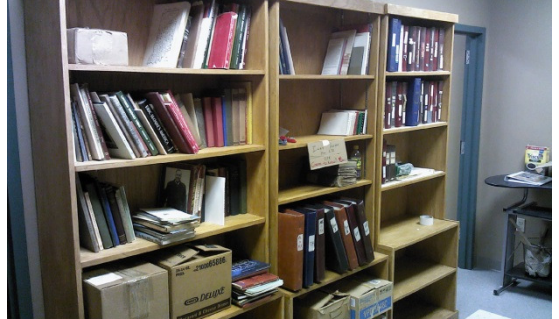
researchers will be able to access the information contained within the room.

We have been spending our days off organizing and inventorying the collection. Once the room is ready for visitors, we will share more details about how