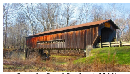
Benetka Road Bridge (c1900)

The base of operations: Ramada Austinburg/Ashtabula, 1860 Ashtabula-Austinburg Rd, Austinburg, Ohio. The group rate is $89.99 per night which comes to $105.96 after taxes. To make a reservation, call the