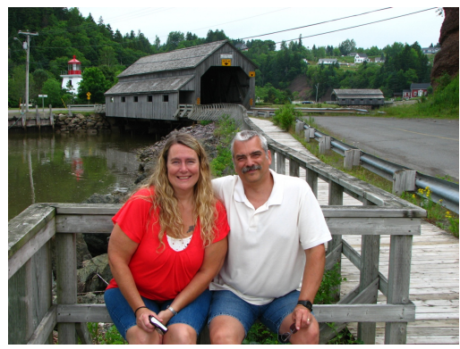
St. Martins, New Brunswick

Shortly before we went to press, the Saint John Telegraph-Journal ran a story about the upcoming replacement of the Vaughan Creek Bridge in St. Martins. The bridge, which draws tourists to the town, was declared unsafe and closed to vehicle traffic last fall. A temporary one-lane structure was built alongside it to carry the traffic. Years ago, the town enhanced this very scenic location by adding sidewalks and a bench at a location where the Vaughan Creek and