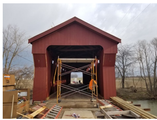
Parker Bridge (top), Swartz Bridge (bottom)