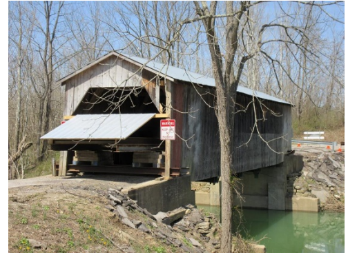
Dover Bridge April 8, 2018