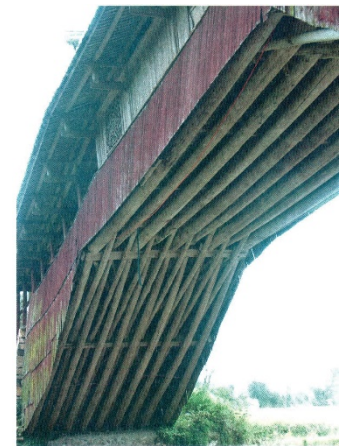
Wenxing Bridge's woven polygonal arch