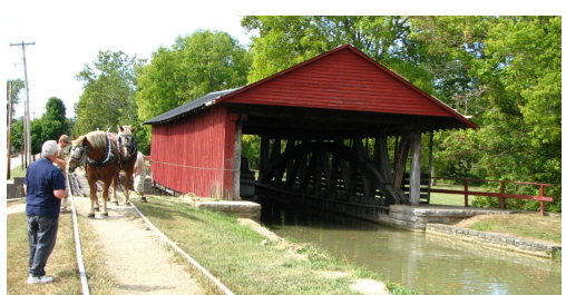
Metamora Aqueduct during NSPCB/ICBS Tour, September 2015

Work on the Duck Creek Aqueduct began in late January. Details of the project are not known although a number of photos of the work (including