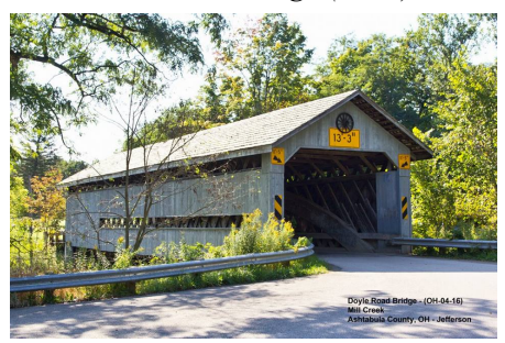
Doyle Road Bridge (1883)

Planning for the 2018 covered bridge tour is well underway. This year's trip to Ashtabula County will be a joint adventure with the New York State Covered Bridge Society and is destined to be another memorable outing. We are grateful to our friends and members at Smolen Engineering for volunteering to organize the weekend.