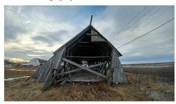
Pont de la Chute Neigette, Saint-Anaclet-de-Lessard, MRC de Rimouski-Neigette -61-58-03

Last quarter, we reported that the covered bridge at Saint-Anaclet-de-Lessard was moved to make way for a new modern bridge. The 70 ton structure will be placed at a nearby location to become an interpretive center with a small park. We have not heard of any update on this since Gérald Arbour's report last November. The project is led by the Corporation du patrimoine de Saint-Anaclet (Saint-Anaclet Heritage Corporation).