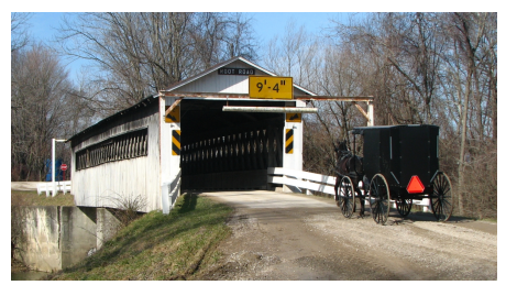
Root Road Bridge (1868)