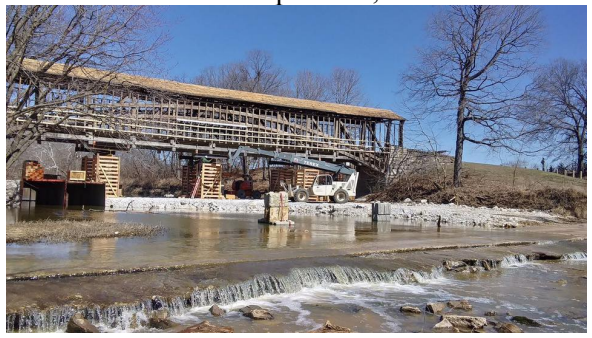
Chuck Mason Photo, March 2018

The Missouri State Parks, which owns and oversees the Union Covered Bridge State Historic Site, recently awarded a $647,100 contract to Martin General Contractors of Eolia to replace and reinforce some of the bridge's main structural support beams. It also will install new cedar shingles, along with some new clapboard siding as needed. The company also will remove years of accumulated graffiti that covers much of the bridge. The project was planned to be completed in mid-May until floodwaters washed away four of the six cribs supporting the bridge during the repairs. Once the water recedes, crews will rebuild the cribs. (Email from Jim Rehard, Northern Missouri Historic District Supervisor, Missouri State Parks.)