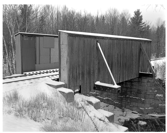
Moose Brook Bridge, Gorham, NH November 29, 1985.