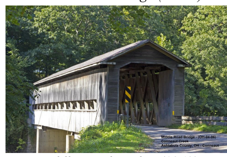
Middle Road Bridge (1868)

hotel directly at 440-275-2711. Wait for the menu options to finish and a hotel clerk answers. Mention that you are with the covered bridge society to get the group rate.