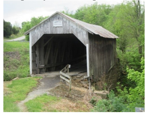
Grange City Bridge

The previous Newsletter noted that Arnold Grāton Associates had started work to stabilize the bridge after it was damaged by floodwaters during the night of July 22-23, 2017. That work is now complete, and the bridge is awaiting funding to repair the damage.