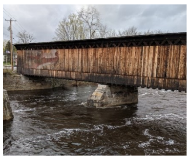
Drewsvílle or Prentíss Brídge, Sullívan County -#29-10-07