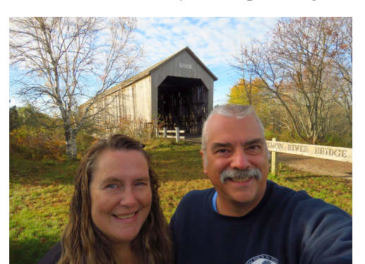
Salmon River Bridge, Sussex, New Brunswick

To help spread the word about our mission, the National Society for the Preservation of Covered Bridges, Inc. has a Facebook page. The page is used for sharing current bridge related news and Society meeting information. If you use Facebook, visit us at <u>http://www.facebook.com/nspcb.</u> "Like" our page and share it with your friends.