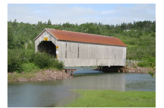
Tynemouth Creek Bridge, 55-11-04

We will keep you updated as things progress.