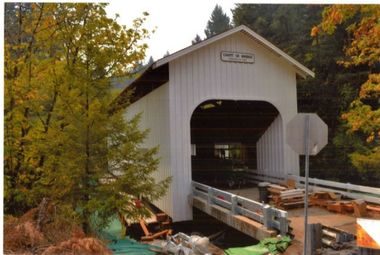
Cavitt Creek Bridge, August 2015

Work as to begin on the Rochester Bridge in early September and expected to be completed by the end of November.