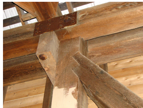
Truss connection in the Norris Ford Bridge