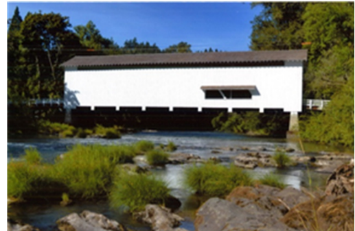
Pengra Bridge, August 2015

In the Summer and Fall Newsletters, we mentioned that Douglas County is working on three of its covered bridges: the Neal Lane Covered Bridge (WG #37-10-07), the Cavitt Creek Bridge (WG #37-10-06) and the Rochester Bridge (WG #37-10-04). The $2.2 million project included the replacement of roof and siding as well as replacement of other structural components while maintaining the original look of the structures.