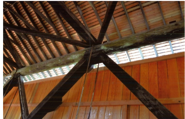
Note log used for upper chord