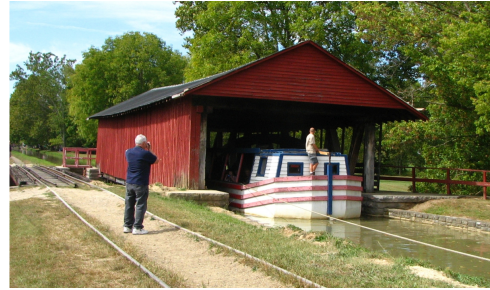
The Friday portion of the tour included a horse-drawn boat ride through the Duck Creek Aqueduct covered bridge.

At our next stop, Offutt's Ford Bridge (WG #14-70-02), we were joined by members of Rush County Heritage Inc. who hosted a picnic at the bridge. Becky Webb, a descendant of