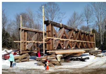
Bridge Under Construction, Alna, Maine, December 16, 2017