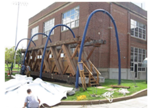
Trusses at CWRU, September 2014

The NSPCB investigated a number of sites for the bridge's ultimate location and it was decided to reconstruct the structure as part of the Wiscasset, Waterville and Farmington Railway in Alna, Maine. The WW&F is a non-profit organization working to reconstruct part of a former narrow gauge railroad which was abandoned in the 1930's. A Memorandum of Understanding was signed in July 2017 to start this process. The bridge structure was completed and ownership transferred to the WW&F on June 9, 2018.