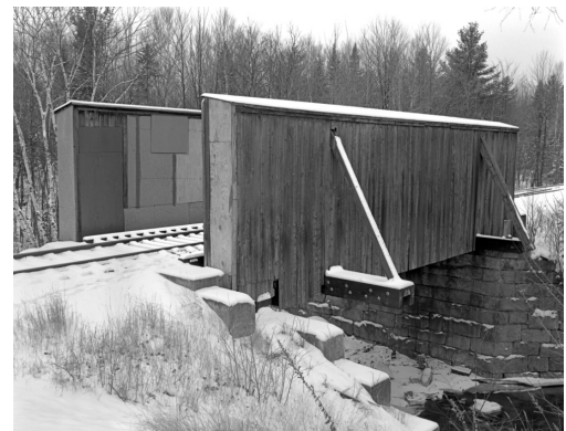
Moose Brook Bridge Before the Fire.