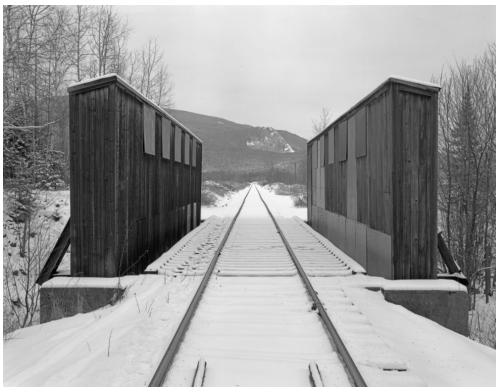
Moose Brook Bridge Before the Fire.

was favored by railroads for its rigidity and simple framing connections, and was used extensively on railroad lines in the United States and Europe in the nineteenth century.