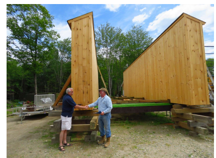
Transfer of Ownership June 9, 2018