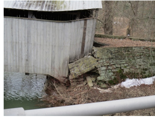
Go Fund Me Page