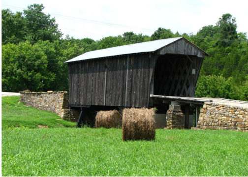
Goddard Bridge, Fleming County, KY