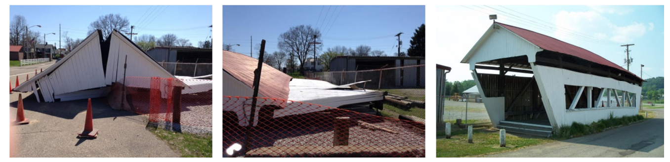
(Lancaster Eagle Gazette, May 2, 2016)