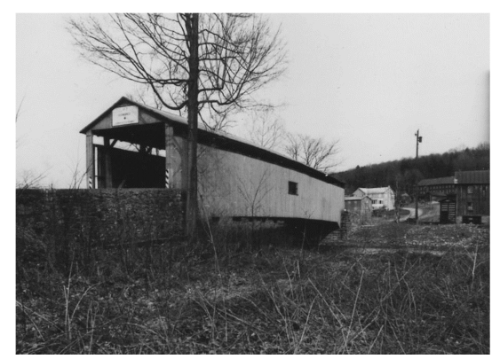
April 9, 1965

(From: E-mail correspondence between DCBPP and NSPCB)