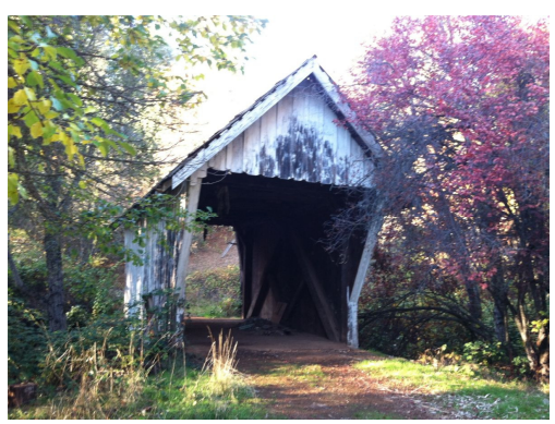
Simpson Ranch Bridge

Northeast of Meadow Vista. 0.85 miles northeast of Combie Rd. on Placer Hills Rd. in Meadow Vista, then 200' on walking trail on the northwest side of the road to the bridge. N39 00.60 W121 00.67