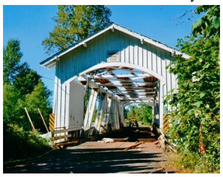
Top to Bottom: Chitwood Bridge Mosby Creek Bridge Hannah Bridge Larwood Bridge